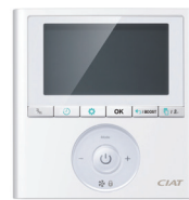
Wired control (option)